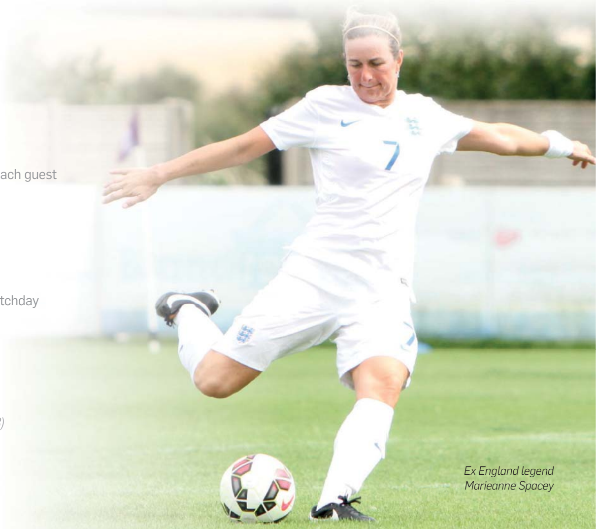
Ex England legend Marianne Spacey

*If received before print deadline for programme (1 August 2018)